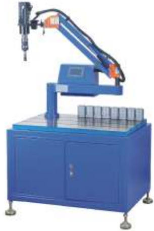
SV Standard Arm Vertical Head Machine ( Order Code 'SV' )