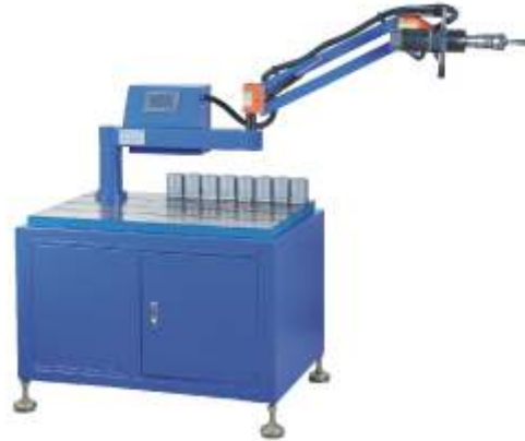
SU Standard Arm Universal Head Machine ( Order Code 'SU' )